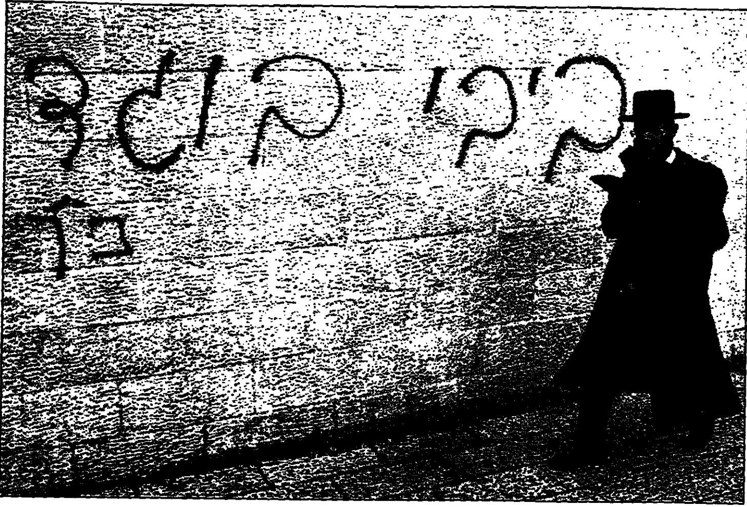
A haredi passes graffiti reading 'Bibi is a traitor' yesterday, painted on a downtown Jerusalem wall overnight and signed by the outlawed Kach movement.

He wondered "what happened to the notion of direct negotiations and why the American role was allowed to be so dominant in the process, to the point that we lost